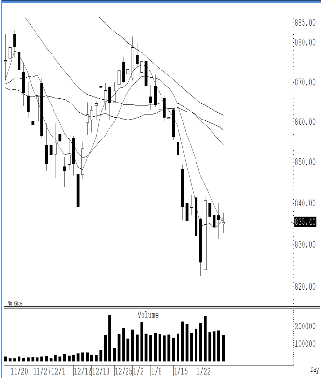
S50H24 (Close 835.40 Chg -0.70)